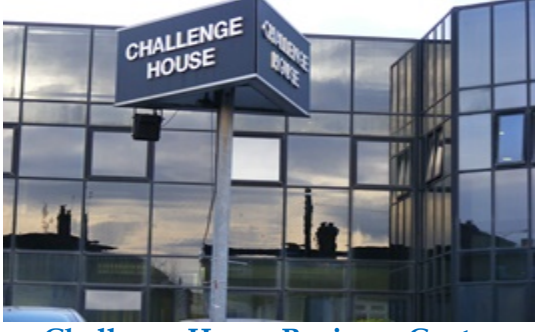
Challenge House Business Centre

Published by: MODESTUM LIMITED Publication Office: Suite 124 Challenge House 616 Mitcham Road, CRO 3AA, Croydon, London, UK Phone: + 44 (0) 208 936 7681 Email: publications@modestum.co.uk Publisher: http://modestum.co.uk Journal Web: http://www.ejmste.com Twitter: https://twitter.com/ejmste Facebook: https://www.facebook.com/ejmste